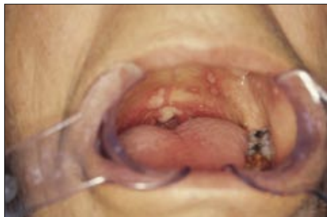
Herpes simplex viral lesions