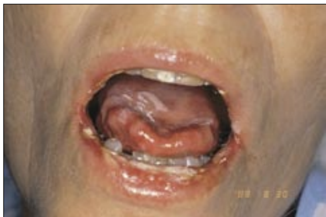
Mucositis, Candida albicans, and herpes simplex